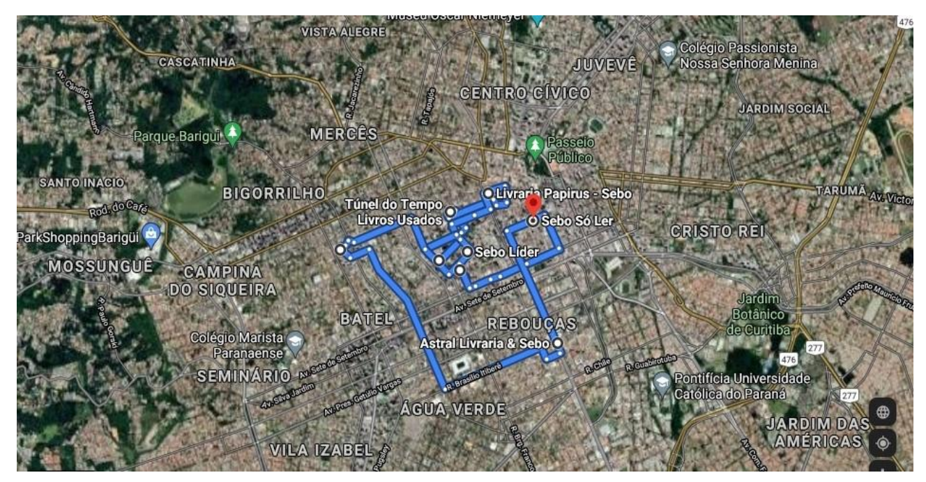
Figure 2. Circuit of sebos and sebos-bookstores in Curitiba.

The investigated spaces help us better understand the circulation circuit of cultural goods in Curitiba, such as the book, but who are the readers that each one of these places wants to build? Although this is not a question we can answer within the limits of this text, it is relevant to leave it open so that we do not lose sight of the possible places of formation of intellectual cadres as fomenters of ideas and projects.