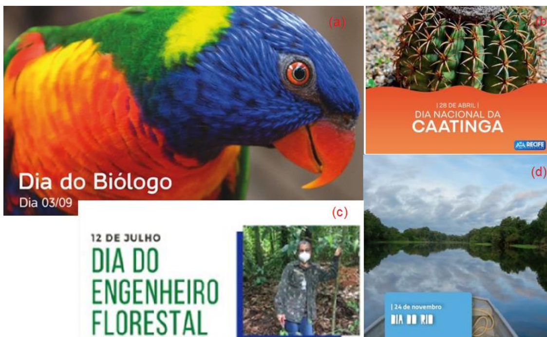
Figure 6. Mapping posts about commemorative days (some examples). (a) informative communication variable; (b) engagement variable: this post stood out in popularity, with a large number of likes; (c) caption variable, hashtags that were related to JBR, without scientific content and describe only the visual content of the image illustrated in the post; (d) format variable. This variable can be perceived based on the type of photo (visual distance from the primary object) and the type of visual (letter, color).

Considering the communicational approach criterion, the communicational focus that is established in the posts (images and captions) is informative. The informative perspective appears in practically all subtitles. As for the textual or image patterns of the posts, the format variable criterion is used, which can be perceived based on the type of photo (visual distance to the primary object) and visual (letter, color), as described in methodology. Regarding the type of photo, it was possible to observe that the posts usually contain images of a section of the forest, some with human elements, others with animals.