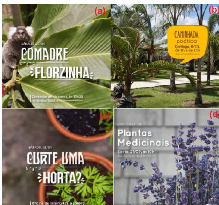
Figure 2. Mapping of JBR's educational activities (some examples): (a) promotional communication variable, showing, through narration, how it is possible to take care of the forest and animals using the character from Brazilian folklore; (b) This post stands out in popularity, with a large number of likes; (c) communicational variable that is also promotional, showing planting and cultivation techniques necessary to create a vegetable garden at home; (d) format variable.

Considering the communicational approach criterion, which makes it possible to infer how educational activities are approached in Instagram posts, the focus that predominates in the images is promotional, which consists of publicizing the activity, signaling the date and time. The subtitles have a diverse perspective. In addition to the promotional bias, which was already expected, there is an entertainment nature. In this way, educational activities in a promotional and entertainment form at the Recife Botanical Garden come as a way of popularizing and valuing the space, to awaken a critical look at environmental issues in a playful way (Vendrasco, Cerati & Rabinovici, 2013). The perspective of mobilization is not observed, when there is an invitation to action and engagement in different actions. In Figure 2, only a small sample of the cut is presented.