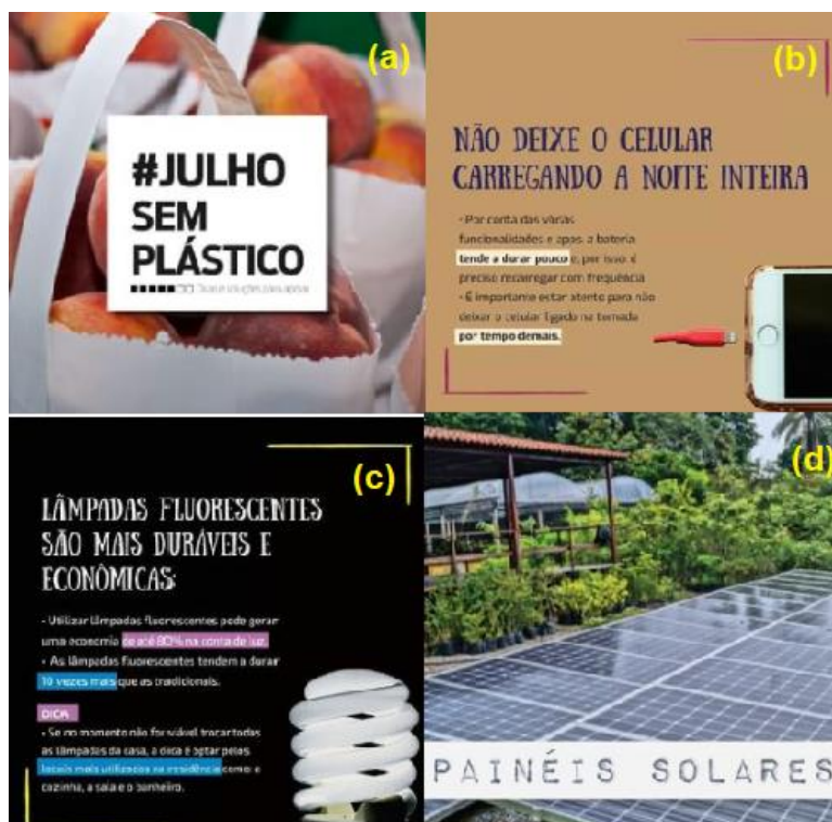
Figure 4. Mapping about sustainability and nature (some examples). This is an approach that aims to raise awareness, invite action and mobilize the public in relation to environmental issues: (a) engagement variable: this post stood out in popularity, with a large number of likes; (b) caption variable guiding security measures; (c) informative communication variable, in which the dissemination of information predominates; (d) format variable, in which the visual aspect of the photo (visual distance from the primary object) and the type of visual (letter, color) stand out.

A selection of the multiple posts on environmental issues that aim to raise awareness among the visiting public through the work of the JBR communications team is presented. The posts were organized according to the visual content criterion, with the number of likes, comments and caption variables that can be understood as public engagement in relation to the published content. The color blocks signal the grouping of posts that share the same content. In Figure 4, a small section stands out.