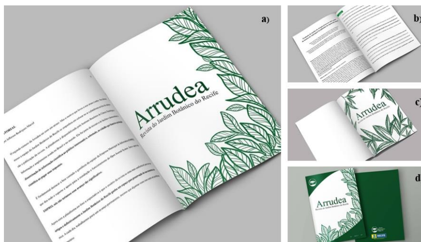
Figure 5. Mapping of JBR articles (some examples): (a) engagement variable; this post stood out in popularity, with a large number of likes; (b) informative communication variable, in which the dissemination of information predominates; (c) caption variable; (d) format variable.

belongs, according to the methodology. The posts were organized according to the criteria of visual content, communicational approach, format, popularity and caption variables. Figure 5 shows a small section of this picture.