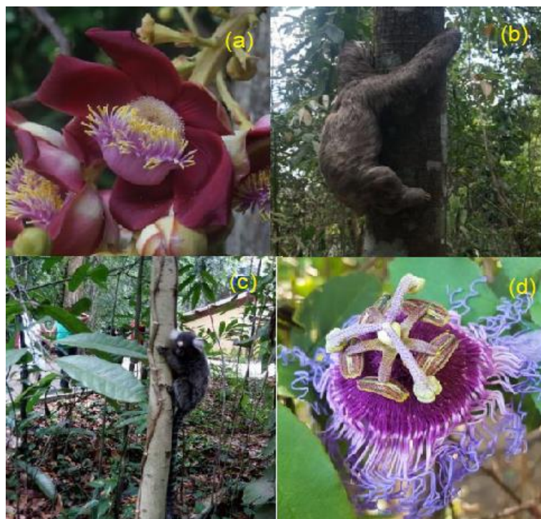
Figure 3. Mapping of JBR's specific contents (some examples): (a) format variable, characterized by extreme close-up; (b) post that became popular with a large number of likes; (c) informative communication variable, in which the dissemination of information predominates; (d) caption variable, with emphasis on the visual aspect.

A reasonable variety of specific content was found in the posts made by the JBR communications team. A section of the content covered in the published posts is presented, including the image and description related to each post, as well as its numbering, number of likes, comments and captions that can be understood as public engagement with the content. disclosed. Figure 3 shows a small section of this picture.