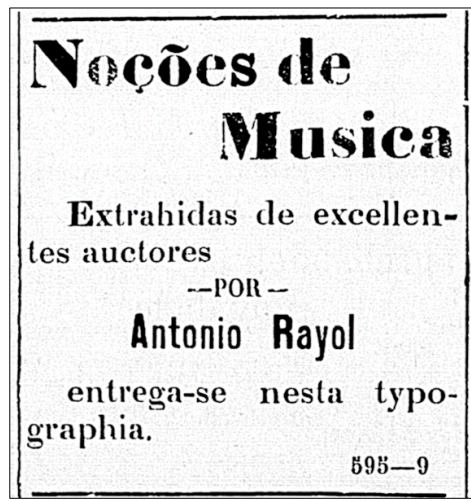
FIGURE 2: Advertisement of the book Noções de musica , by Rayol.