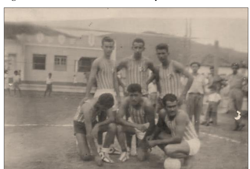
Figure 1 - Porteirinha/MG Men's Volleyball Team