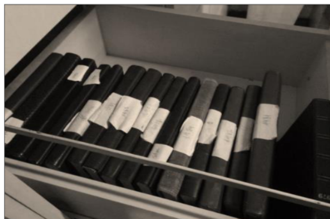
Photo 2 -Drawer at the IDCH/UDESC with the appointment books

The number of received and kept correspondences is very significant. The letters are varied, from some Brazilian states, from Portugal, Mexico, Uruguay, Argentina, United States, Colombia, for example, which confirm the internationalization of his works and activities and, over all, his relations of power and prestige in the professional domain. Such sources remain open and available for future researchers. A first look allows to consider that many of the texts of the correspondences are in the protocol limits of a formal writing, but this does not require more vigorous research.