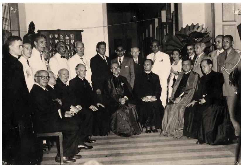
Image 2: On 18/08/1953 with personalities from Pará and some members of the Academia Paraense de Letras.