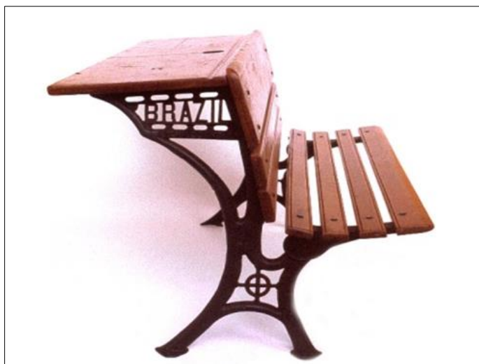
Figure 1 - Brazil School desk - CRE Mario Covas