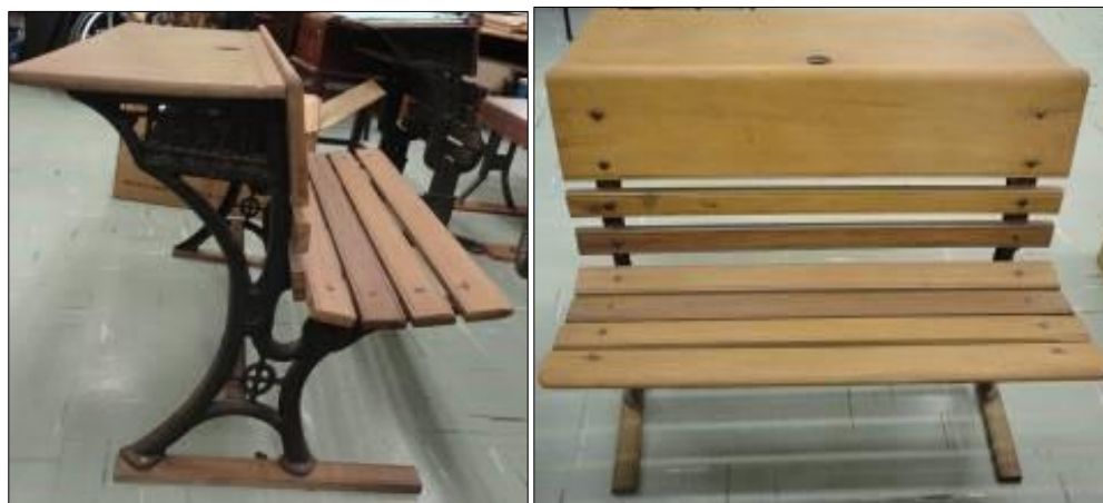
Figure 2 e 3 - Brazil School desk – CMFEUSP

Source: Memory Center of Faculty of Education (University of Sao Paulo).