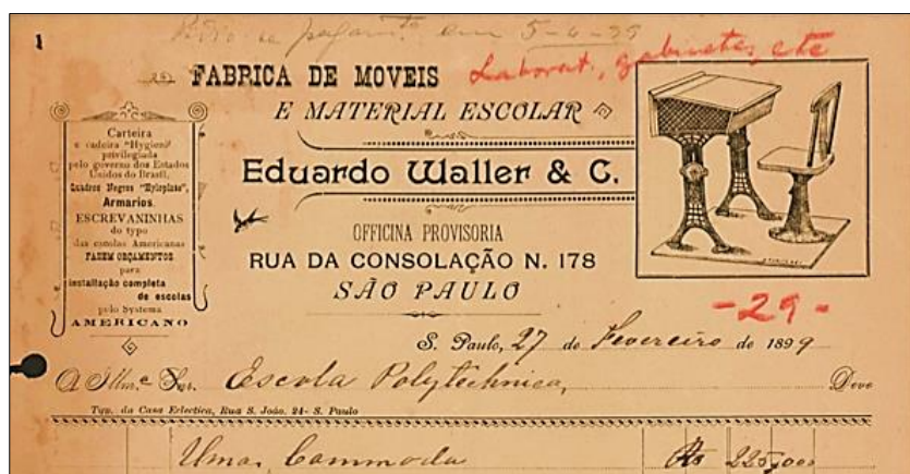
Figure 5 - Purchase note from Polytechnic School