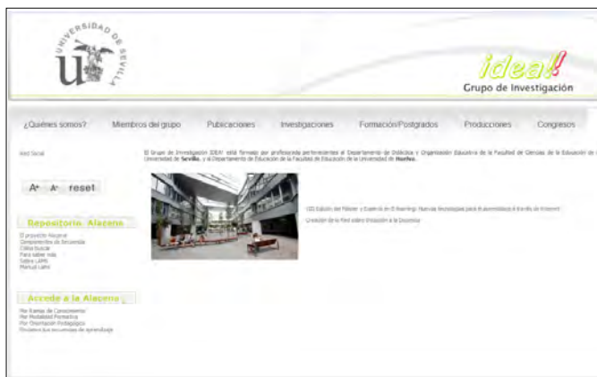
Figure 1. Screenshot of the web page and the Alacena repository: http://prometeo.us.es/idea .

Since its creation, Alacena has been an open resource available to university teaching staff with the sole purpose of allowing them to find the representation of a variety of highly innovative learning sequences that can help them to effectively design their own courses. Furthermore, it has been conceived as a resource to be permanently constructed and added to, as it receives contributions from those university teachers who choose to share their own experiences. Nevertheless, we are aware that there is not a tradi-