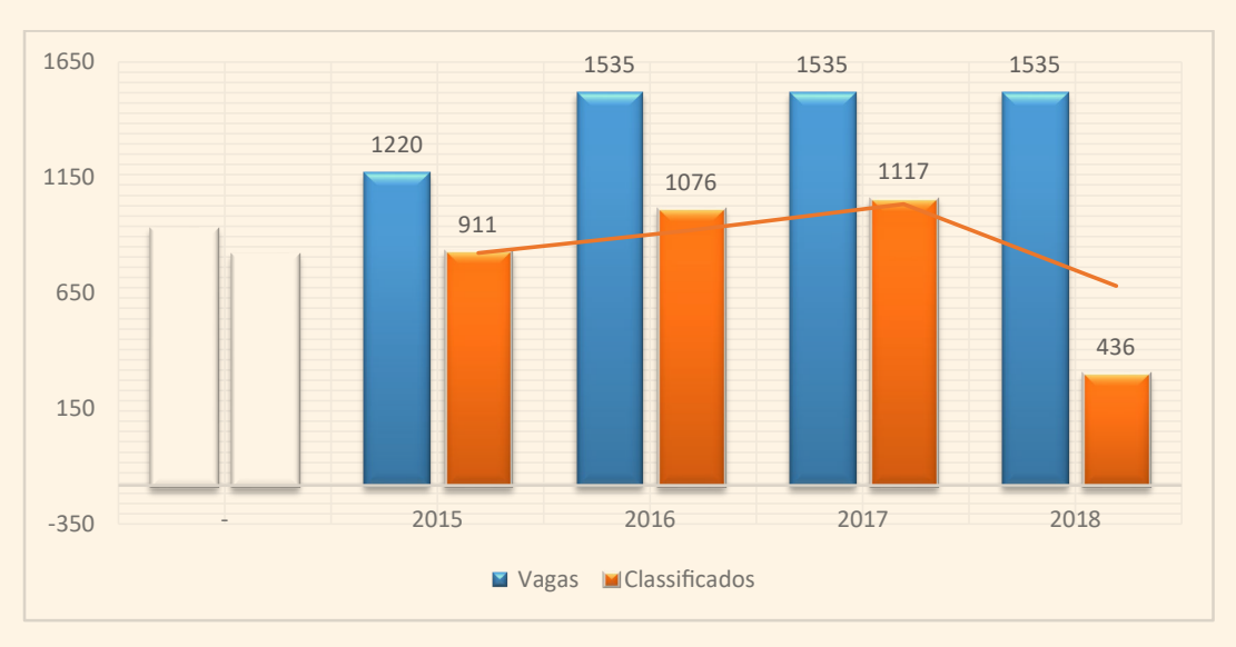
GRAPH 2 CLASSIFICATION BASED ON THE VACANCIES OFFERED TO BLACK (BLACK AND BROWN) PEOPLE FROM 2015 TO 2018