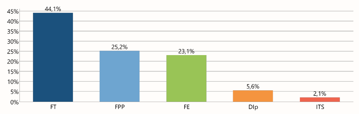
Figure 6 Segments with codes: The formative assumptions of training policies