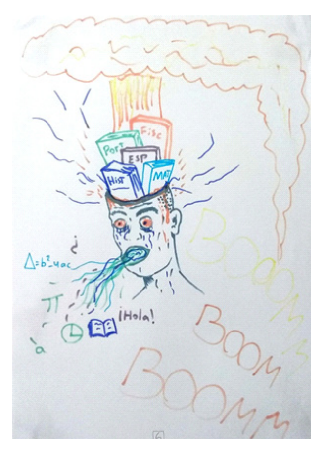
Figure 1 – Effects of the standardized school model on students.