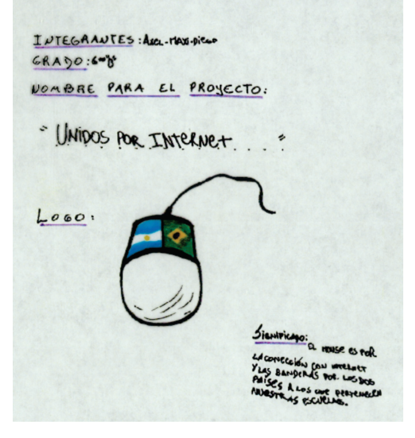
Figure 1. The joint logo as a sign of intercultural communication.

Alongside explicit learning projects like the one just mentioned, the entire internet is naturally accessible as an enormous knowledge and learning space with its databases, newsletters, search engines and discussion forums. Learners have countless possibilities to create a hypertext combining many different nuggets of knowledge on a topic which interests them. Hypertexts are individually created texts which can be changed at any point and which are geared to the individual needs of the learning subject. Knowledge in virtual space cannot be described as a static pyramid; rather it takes on the form of a dynamic network. It develops into a reading-writing continuum in which the roles of the