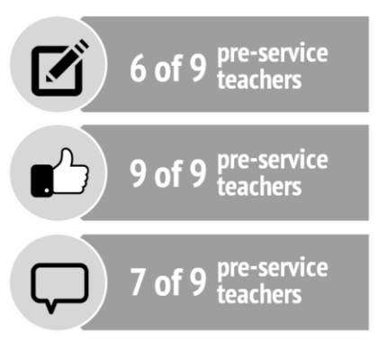
IMAGE 1 – Interaction of pre-service teachers in Facebook according to initial questionnaires

On the other hand, participants did not see themselves as mere observers as they reported being engaged in interactions either by responding to posts or spontaneously sharing information, specially on Facebook. For that, an unexpected result was the observation that the engagement of participants with Facebook was considerably different in practice (as observed in the interactions in the Facebook group) and in theory, as reported by them in the questionnaire, as shown in Image 1.