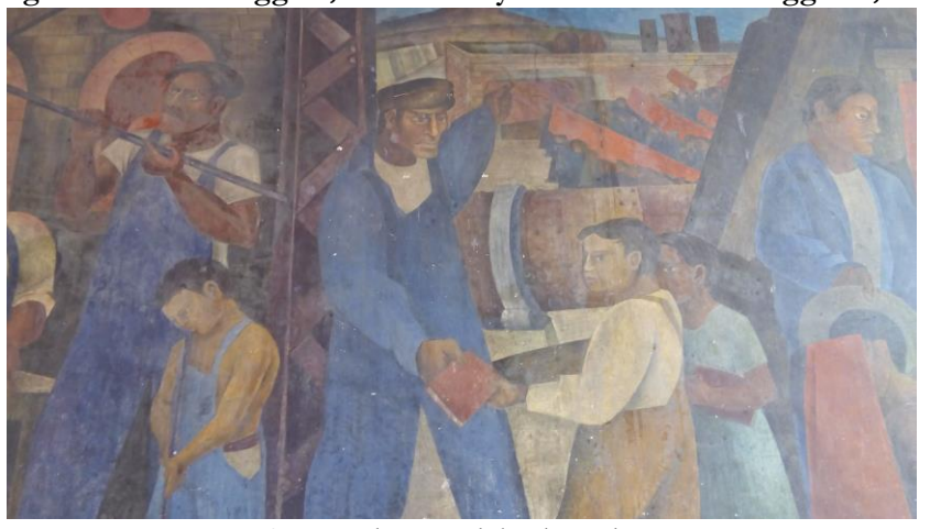
Image 8. Pablo O'Higgins, "The reality of labor and its struggles", 1933.