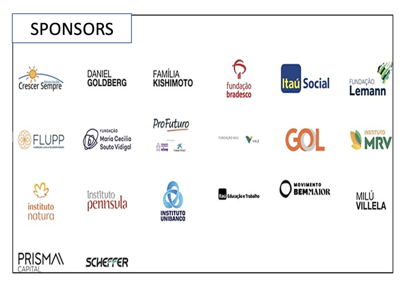
FIGURE 3 – Companies that support Brazil's National Core Curriculum Movement

The RCG, in turn, was produced during the government by José Ivo Sartori (2015–2019), belonging to the Movimento Democrático Brasileiro (MDB), and is being implemented during the term of Eduardo Leite (2019–2022) (Rio Grande do Sul State governor), belonging to the Partido da Social Democracia Brasileira (PSDB) aligned to the center-right wing that presents an action manner that is very similar to the ones by private actors during the RCG implementation process.