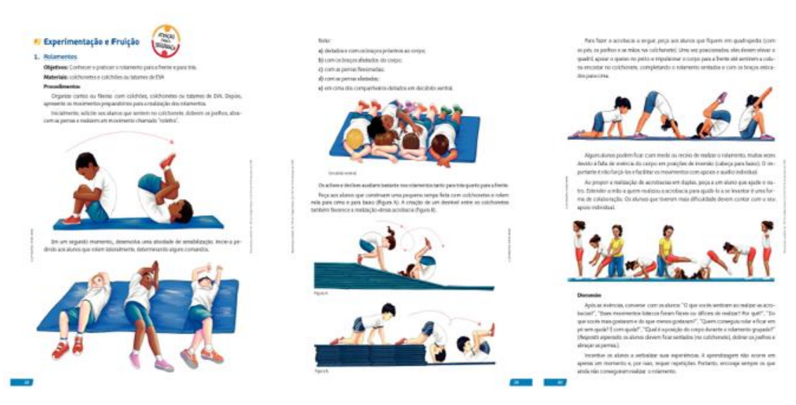
Figure 6 - "Experimentation and fruition" for the unit on Gymnastics

futsal, football, handball, field hockey, water polo, rugby etc.; Combat [sports]: [...] judo, boxing, fencing, taekwondo, etc. (BRASIL, 2017b, p. 215).