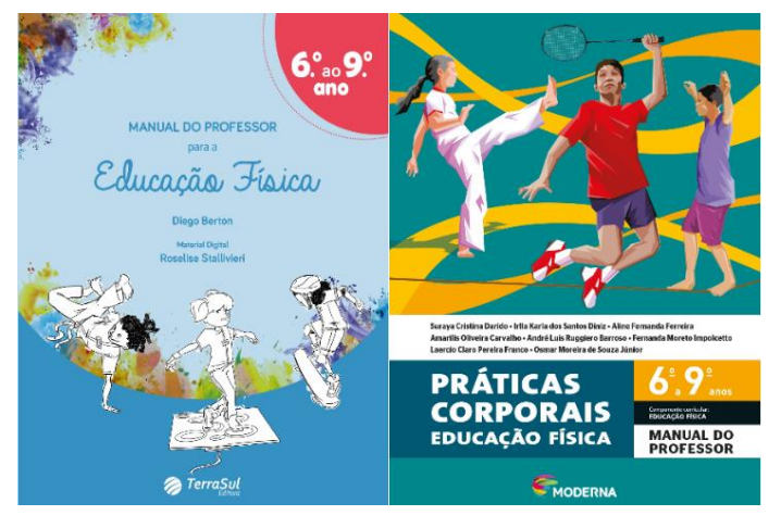
Figure 3 – Physical Education teacher's manuals in the 2020 PNLD – Final Years