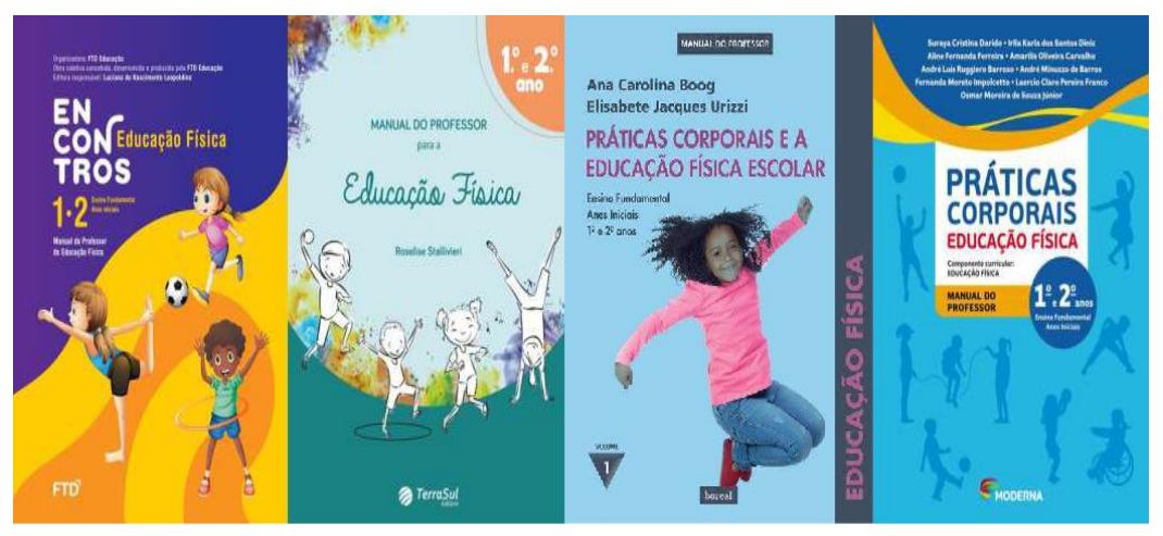
Figure 2 – Physical Education teacher's manuals in the 2019 PNLD – Initial Years

Figures 2 and 3 illustrate the (printed) Physical Education teaching manuals that were submitted to the evaluation rules contained in the 2017 call notice (BRASIL, 2017a) and contemplated in the PNLDs for 2019 (BRASIL, 2018) and 2020 (BRASIL, 2019). The 2019 PNLD was directed towards the first segment of grade school (1st through 5th grades), while the final years (6th through 9th grades) were contemplated in the 2020 PNLD.