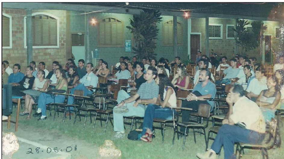
FIGURE 2: 1 st Mathematics Week