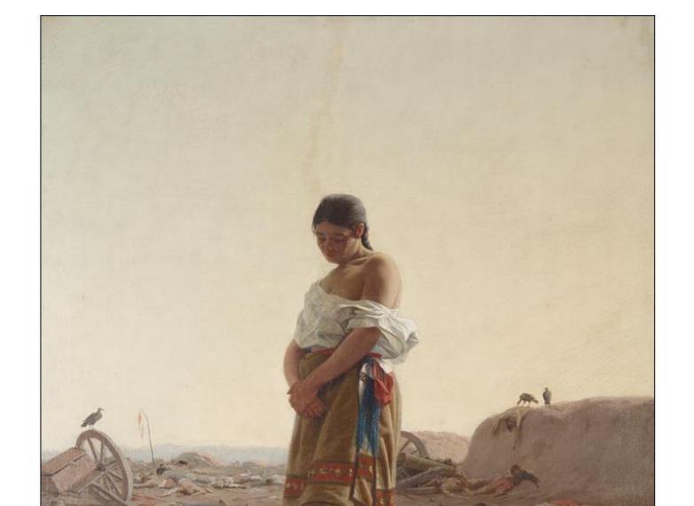
FIGURE 1: La Paraguaya – Juan Manuel Blanes, 1880.