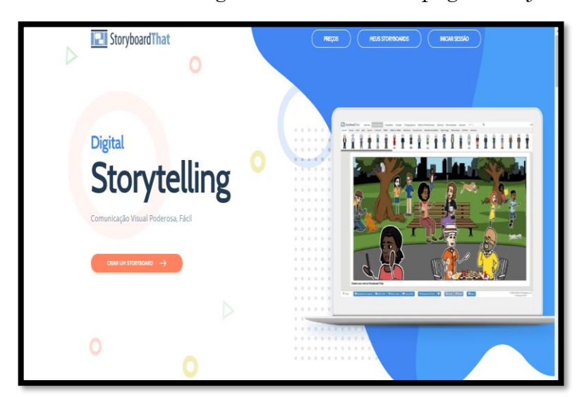
FIGURE 1: Technological resource homepage: Storyboard

In its use, the individual can organize and systematize their ideas, extract elements from a literary text and reproduce, through their own interpretation, scenarios, characters extracted from the supporting text with the most different expressions and body postures, different languages (narrator and characters), among others.