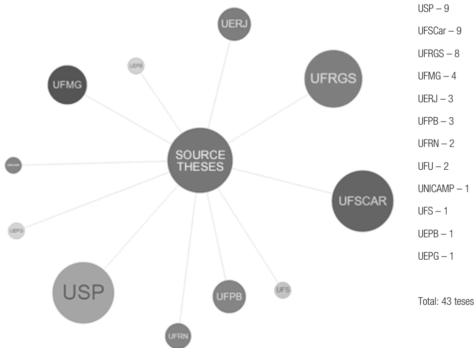
Figure 1 – Conceptual outline of the corpus analyticus (Theses produced from 2012 to 2014)

The complex network of information which is connect and is unfold along the training and the pedagogical daily practice presents challenges for the reading of the educational technologies and the creative work. We took as a foundation for the corpus of the analysis, all the thesis produced in the triennium 2012-2014, in Post Graduation programs in Education from public institutions and found in the BDTD website, using the key words: technology, education and their variations. Based on this search and on the reading of the abstracts, we selected 43 theses on technologies in education. It is worth highlighting that we did not rank the thesis according to the teaching levels and modes, as what mattered to us was the convergence, the incidence, the reach and the concern about the use of the technologies in all educational systems of the country. The table below (Figure 1) shows the location of the thesis selected at different universities.