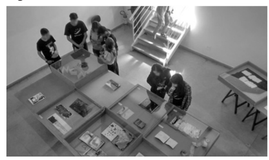
Figure 1- Students at the art exhibition in MUnA.

Thus, when students were taken to the field class in MUnA, they were sent to the museum auditorium first, so that they could receive the first instructions on what the field class and the activities carried out on that day would be like. A professor of the UFU Visual Arts course and museum monitors were in charge of providing the students with information, and acting as mediators. The students were then sent to see the exhibitions that took place in this institution, and were surprised by the contemporary works of art present there, as it can be seen in figures 1 and 2: