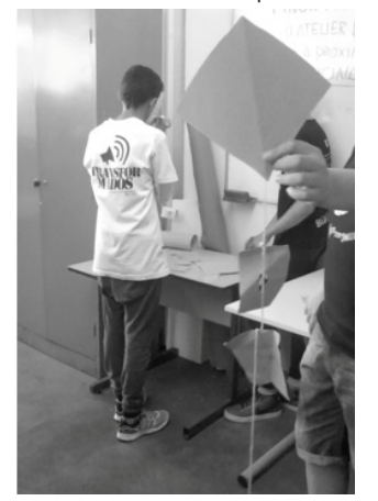
Figure 7- Students in the artistic production in MUnA.

Figures 7 and 8 show other works produced by the students during the educational action in the museum: