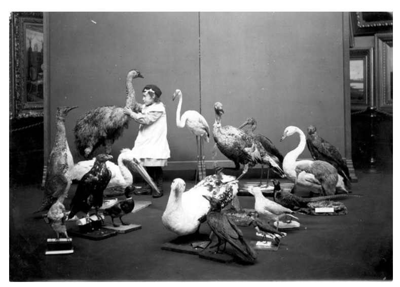
FIGURE 2 - A BLIND GIRL EXAMINING MOUNTED BIRDS