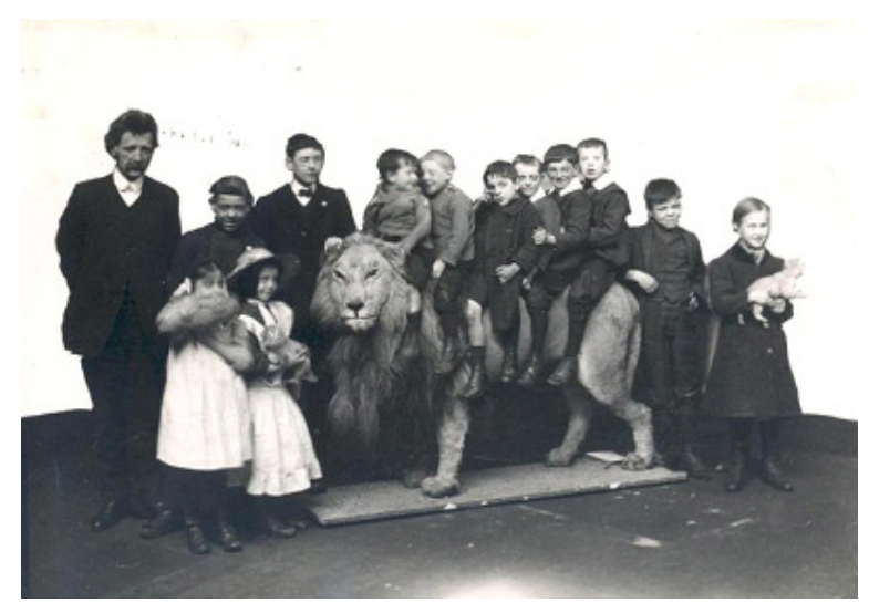
FIGURE 4 - A GROUP OF BLIND CHILDREN FROM SUNDERLAND COUNCIL SCHOOL SITTING ON WALLACE THE LION TO APPRECIATE THE SIZE OF ANIMALS