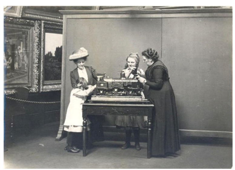
FIGURE 5 - TWO BLIND GIRLS BEING SHOWN A MODEL LOCOMOTIVE BY SIGHTED GUIDES