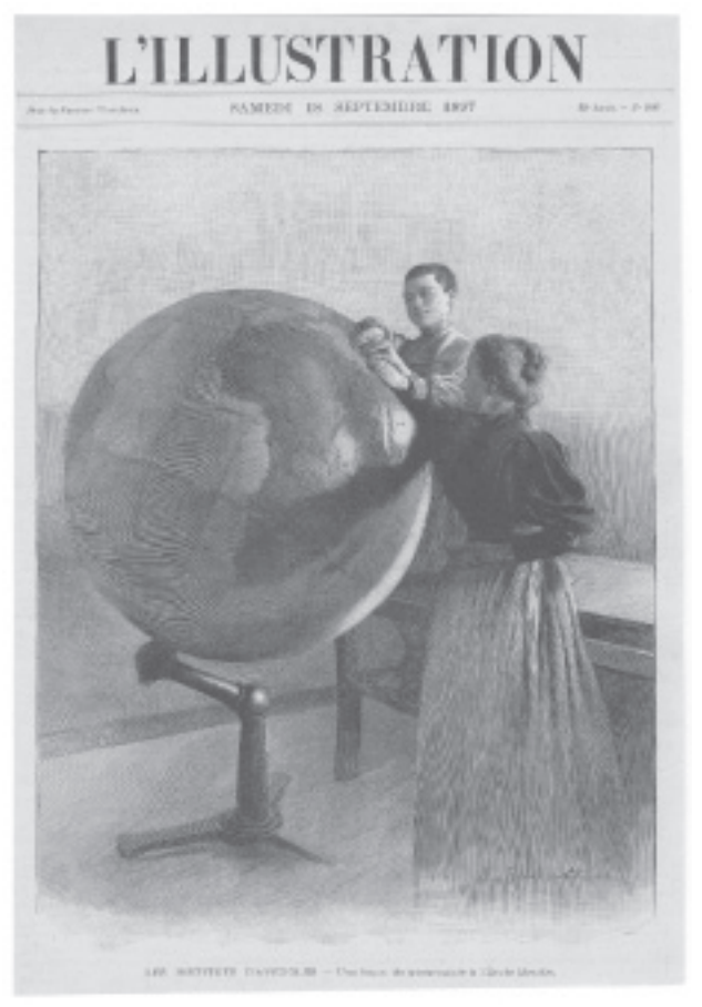
FIGURE 6 - 'UN LEÇON DE GÉOGRAPHIE À L'ÉCOLE BRAILLE', L'ILLUSTRATION, SAMEDI 18 SEPTEMBRE, 1897

case', it had 'convenient receptacles for carbonised or ordinary paper' and the guidance lines 'are made of wires placed on springs, which easily give way on the slightest pressure, and thus enable the writer to form the lower portion of the letters g, y etc.' The report points to such apparatus also being on display at the Great Exhibition of the Works of Industry of all Nations, London 1851 and also at the London International Exhibition on Art and Industry of 1862 (JOHNSON, 1871).