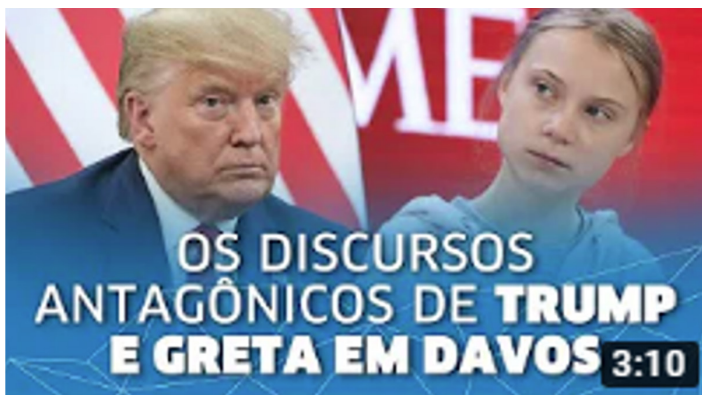
FIGURE 1 – OPENING VIDEO ON CORREIO DO POVO CHANNEL

highlights that, while environmental activist Greta Thunberg accused the world powers of doing nothing to prevent the rising temperature of highlighting that “political ideologies and economic structures have not been able to face climate emergencies and create a sustainable world”, US President Donald Trump defended an antagonistic position and warned the world not to listen to “alarmists”.