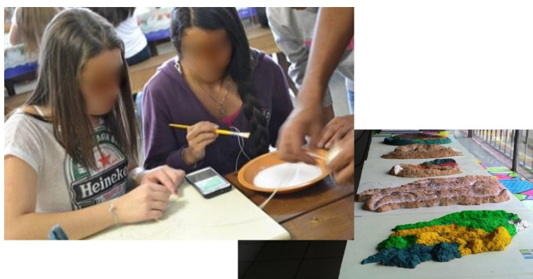
FIGURE 3 – HYDROGRAPHIC BASIN MOCK-UP, CLASSIFIED IN EXPERIENTIAL AND COMMUNICATIVE APPROACHES