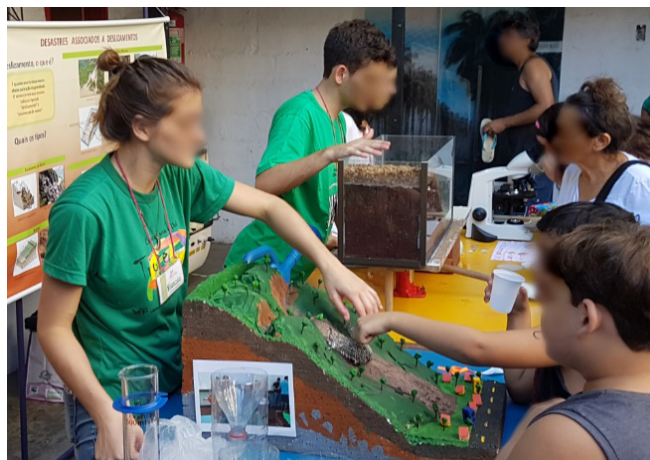
FIGURE 2 – INTERACTIVE MOCK-UP OF LANDSLIDE, CLASSIFIED IN THE EXPERIENTIAL APPROACH