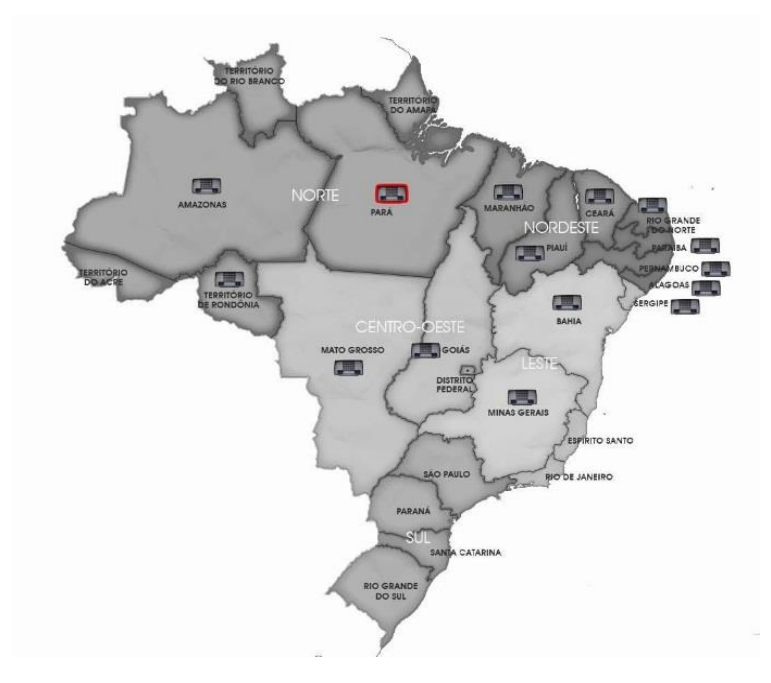
Map 1 – Consumption of captive radio in the system and radio schools in Brazil.

We show below the following implementation of the educational radio system, for states and counties, where occurred the consumption of the captive radio in the most variable States and counties, during the period of 1961 to 1965, as shown on the Map 1 Table 1.