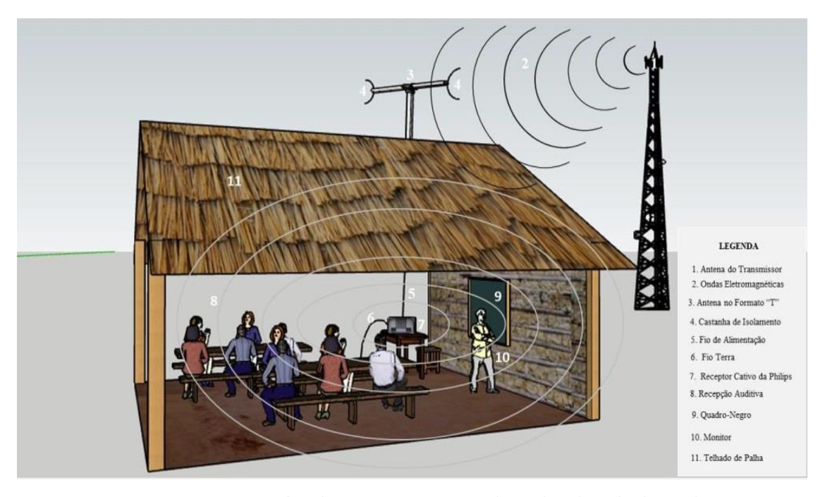
Picture 3 – Reconstitution of a classroom in one radio school with the radio support and its Philips' captive radio.

In the light of the foregoing was possible to understand the cultural practices, developed between the school subject, produce the sense of auditory reception within the radio schools, where the electromagnetic waves that came from the transmitters and arrived in the antennas in the form of frequency, sound and captive wave, to the Philips' captive receptor enable teaching to monitors and students who should learn the knowledge transmitted by SERB's teacher-announcers. In the Picture 3, we present the sense of auditory reception, from a reconstitution of one radio school in Pará's Amazon, in its routine, and the radio supportive objects in the classrooms, according to the information that was raised in the documents.