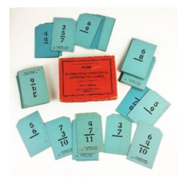
Figure 2 - Washburne individual Arithmetic Cards, N416.