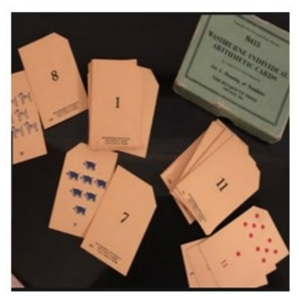
Figure 1 - Washburne individual Arithmetic Cards, N415.