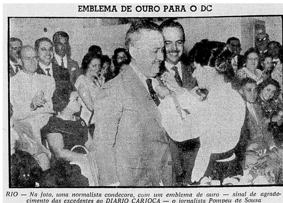
Figure 7 – Gold Emblem for DC.