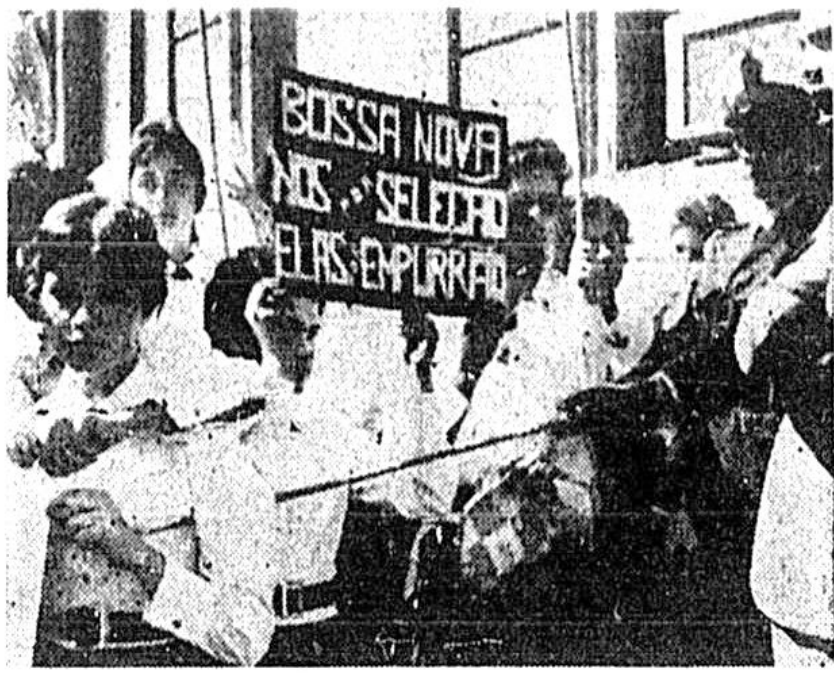
Figure 4 – "Bossa nova: us by selection, them by connection".

After the first show of force, near the federal government's office, the marches of uniformed normalists were banned by the Department of Education of the Federal District (Lima, 2017). What was seen in the following days demonstrated that an agreement needed to be done for the agenda of the House to be unlocked.