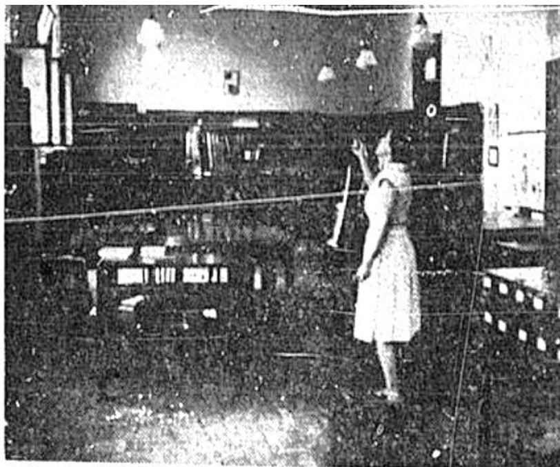
Uma assistente do diretor aponta as infiltrações das chuvas na Biblioteca