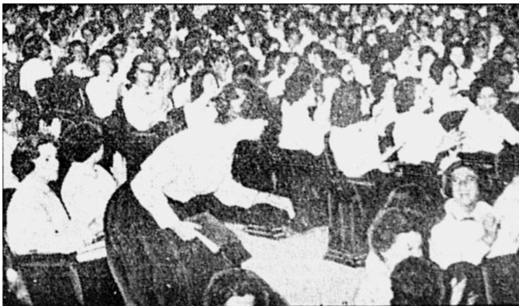
Figure 2 – Normalists (today) with JK: against surpluses.

On April 7, female students from the five regular schools of the Federal District filled the IE auditorium, as can be seen in Figure 2. Ignoring the powers of the City Council and the mayor, the group agreed to directly pressure the Presidency of the Republic at Palácio do Catete . The positioning of the young women and their families was openly opposed to the creation of the new unit, with the argument of the quality of education to be maintained and the lack of structure of normal schools already in operation.