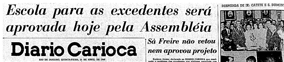
Figure 5 – Farewell of JK: Catete and S. Dumont.