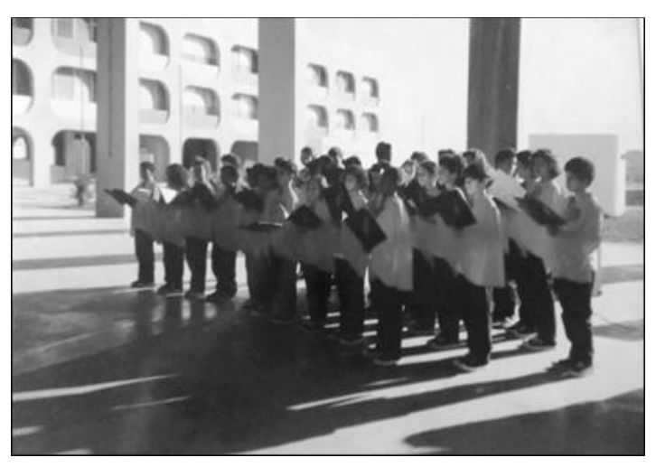
Figure 5 - Cultural animation activity. Legend: Choir presentation (CIEP 150, Cabo Frio, 1994).