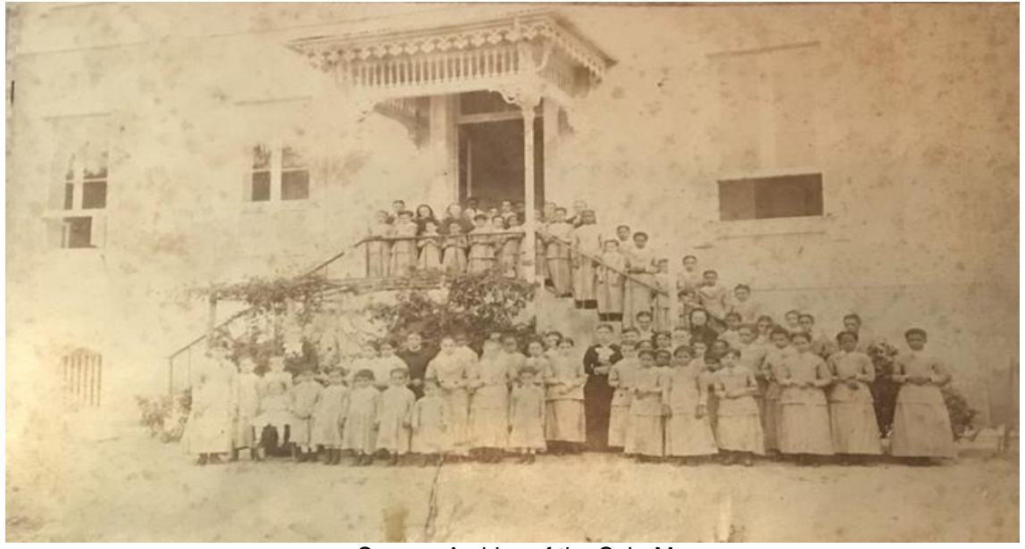
Figure 3 – Photograph of the students at the Domestic School of Nossa Senhora do Amparo with the uniform worn at the end of the 1870s

According to Ribeiro and Silva (2017, p. 577), "[...] the uniform is one of the material elements that comprise the school and its culture, materiality conceived here as one of the constitutive elements of school culture."