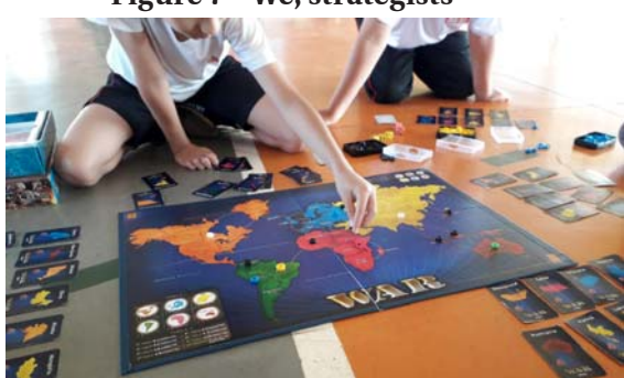
Figure 7 - We, strategists