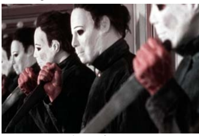
Figure 4 - Where will it come from?

turns, as in Halloween movies, to disturb, to throw things off their axis: Michael Myers, almost ironically, resurfaces. The lesser is always an unpredictable undertaking within the greater; just as the "greaterization" of the minor is an ever-constant risk. The minor shakes modern rationality.