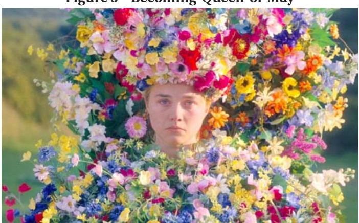
Figure 5 - Becoming-Queen-of-May