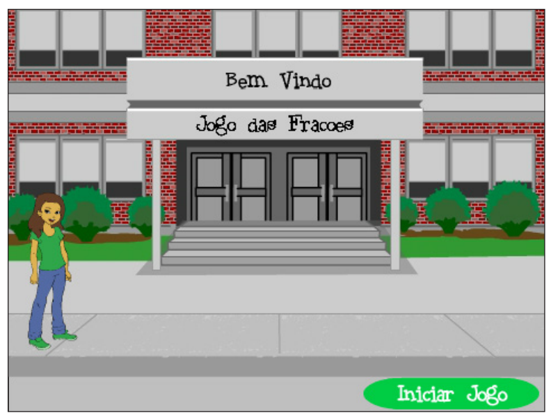
Figure 1 – Home screen of the game